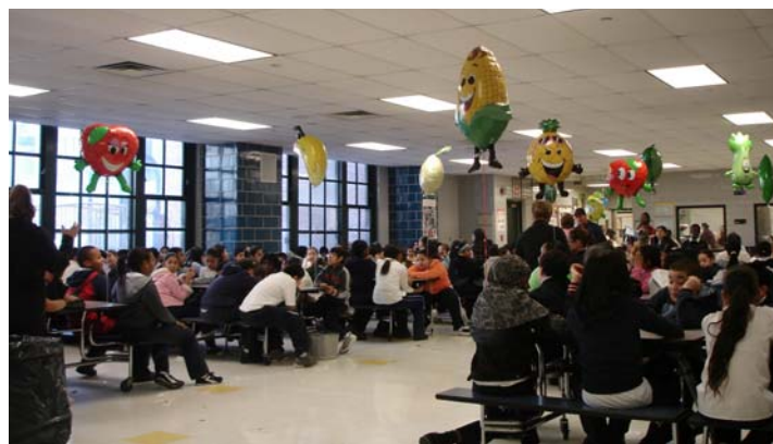
Vegetable and fruit shape balloons filled the cafeteria where students were treated to healthy snacks, like raisins and pretzels

BHH has helped nine public schools in the southwest Bronx develop wellness policies to reverse the current trends of childhood obesity and diet-related diseases. At each school, BHH staff helps to establish a Wellness Committee, comprised of faculty, staff and parents. The committee assesses key health factors in the school, agrees on an action plan, and commits to sustaining the effort over time.