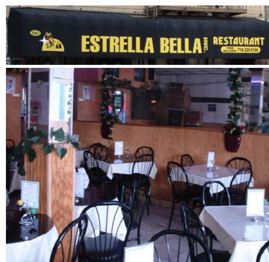
Estrella Bella restaurant adorned with Bronx Healthy Hearts menus

In addition to the restaurant and bodega initiatives, the Commissioner learned about the Coalition's faith-based, Fine, Fit and Fabulous nutrition and fitness program.