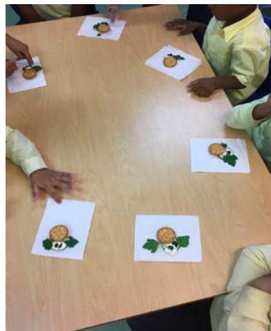
Pre-K Makes Zucchini "Cicadas"