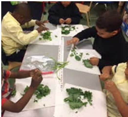
Kindergarteners making kale salad

Yea! Let's celebrate. You are open to making the switch to more physically active and nutritious celebration. That's great! We understand change is challenging, especially when it involves others, so to start you out we found some easy celebration ideas that are direct substitutes for how you may be celebrating now.